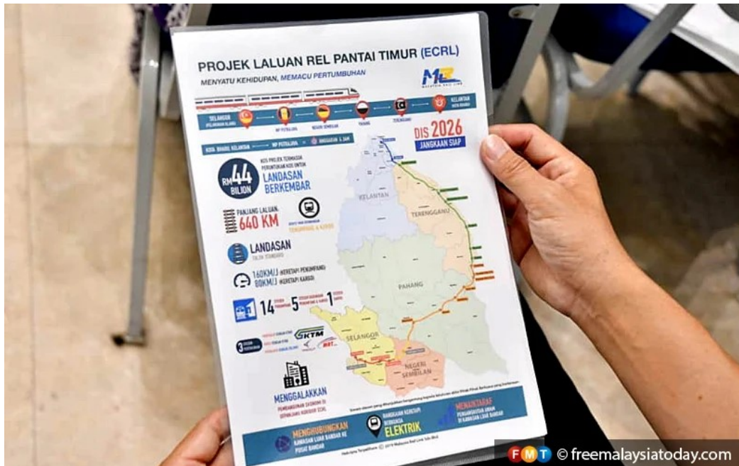
An old map of the ECRL route which will traverse Kelantan, Terengganu, Pahang and Selangor.

PETALING JAYA: A global fund manager has extolled the East Coast Rail Link (ECRL) project as one that has the potential to unite people in different parts of Peninsular Malaysia.